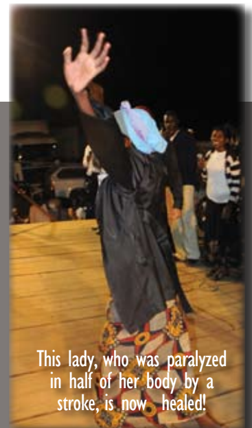
This lady, who was paralyzed in half of her body by a stroke, is now healed!

Augsut 24, 2008 Word of Life Church Birmingham, AL, USA