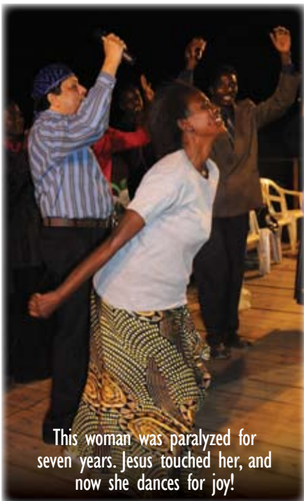
This woman was paralyzed for seven years. Jesus touched her, and now she dances for joy!

The preaching of the Gospel and the miracles that followed the preaching brought great conviction upon the people, and the crowds grew every night. In every service, we saw huge multitudes receive the Lord Jesus. Street criminals, prostitutes, gangsters, and all