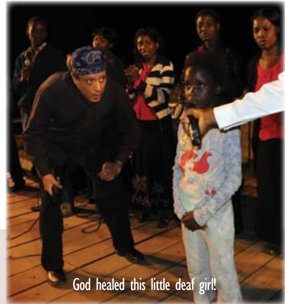
God healed this little deaf girl!