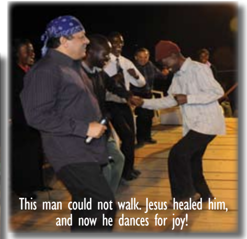
This man could not walk. Jesus healed him, and now he dances for joy!