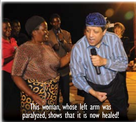
This woman, whose left arm was paralyzed, shows that it is now healed!