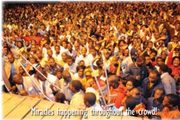
Miracles happening throughout the crowd!