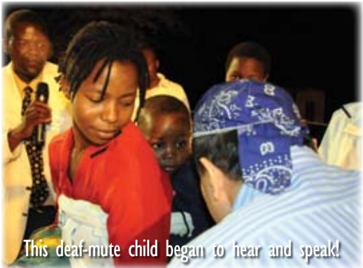
This deaf-mute child began to hear and speak!