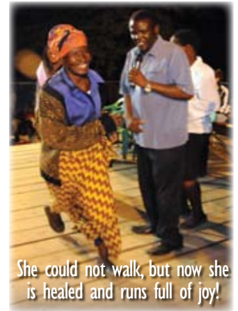
She could not walk, but now she is healed and runs full of joy!