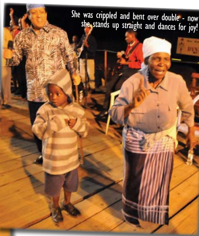
She was crippled and bent over double - now she stands up straight and dances for joy!