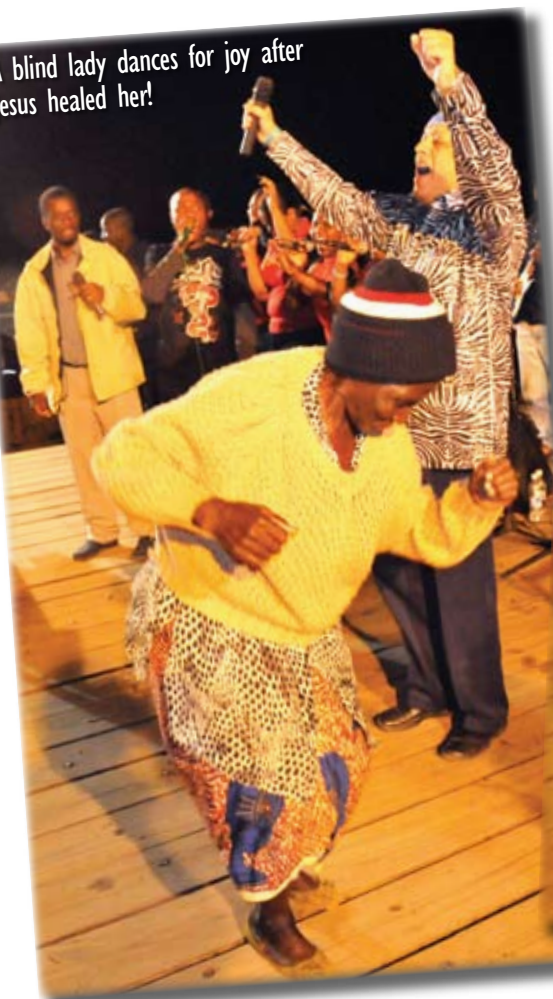
A blind lady dances for joy after Jesus healed her!