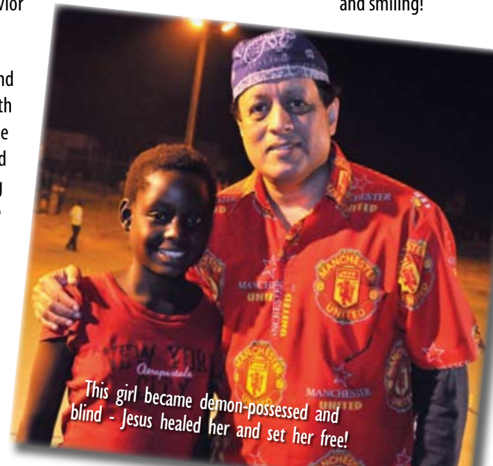
This girl became demon-possessed and blind - Jesus healed her and set her free!

The 13 year-old girl from the first night, who was healed and delivered after she became blind and demon-possessed, came back to see me. She was all happy and praising God! We took a nice picture of her standing with me and smiling!