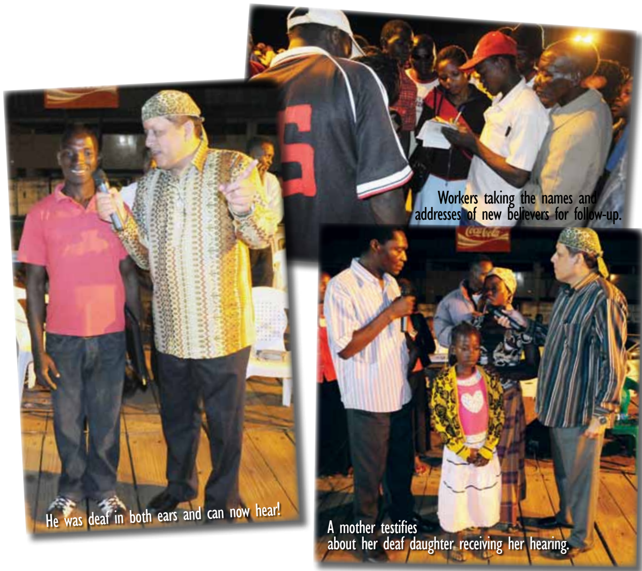
Workers taking the names and addresses of new believers for follow-up.